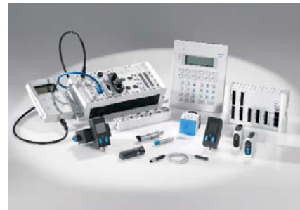
PLCs and I/O Devices PLC's, operator interfaces, sensors and I/O devices