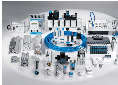
Pneumatics Pneumatic linear and rotary actuators, valves, and air supply