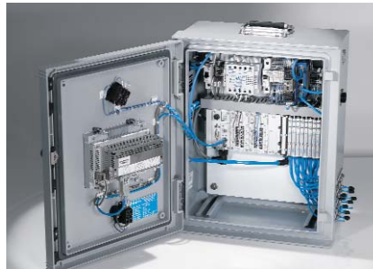
Custom Control Cabinets Comprehensive engineering support and on-site services