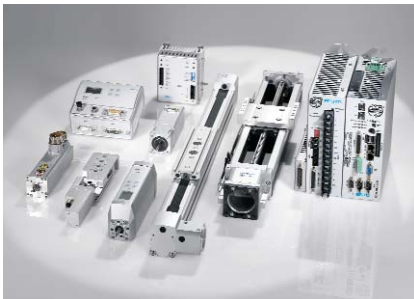
Electromechanical Electromechanical actuators, motors, controllers & drives

With a comprehensive line of more than 30,000 automation components, Festo is capable of solving the most complex automation requirements.