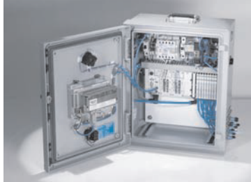
Custom Control Cabinets Comprehensive engineering support and on-site services