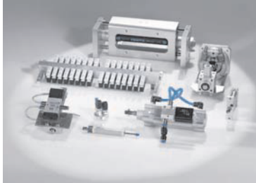
Custom Automation Components Complete custom engineered solutions

Our experienced engineers provide complete support at every stage of your development process, including: conceptualization, analysis, engineering, design, assembly, documentation, validation, and production.