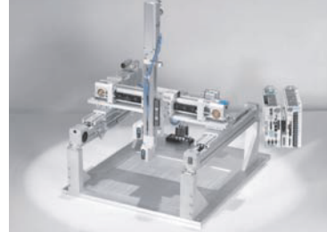
Complete Systems Shipment, stocking and storage services